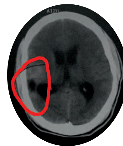
The family physician had circled the abnormality on the film.