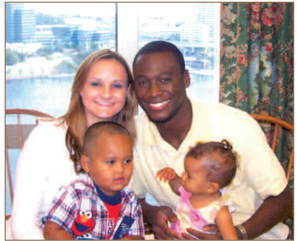
Jane, John, and Babies Doe

After carefully reviewing the proof of Baby Doe's injuries and after Pajcic & Pajcic filed suit, the county's insurance company tendered the policy limits. The proceeds will not only ensure that Baby Doe receives necessary medical care and educational opportunities, but it also appears that there will be enough to buy a home in Baby Doe's name for the family to live in while he grows up.