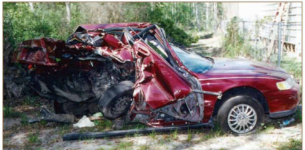
The crash demolished the Doe's car